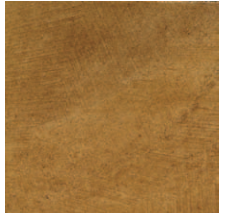
Sepia | 511