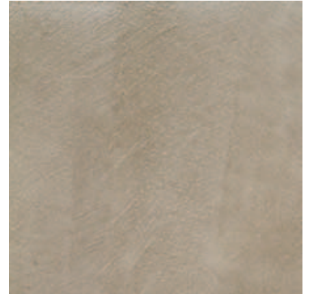
Umber | 521