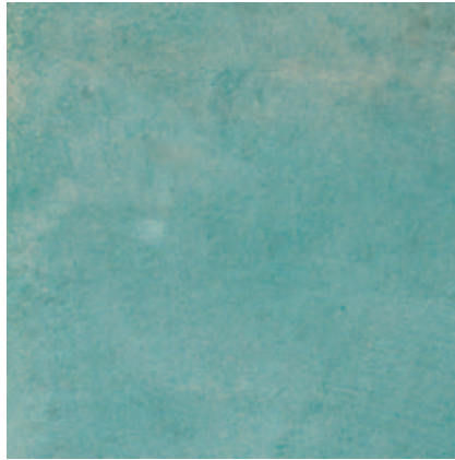
Seafoam | 507