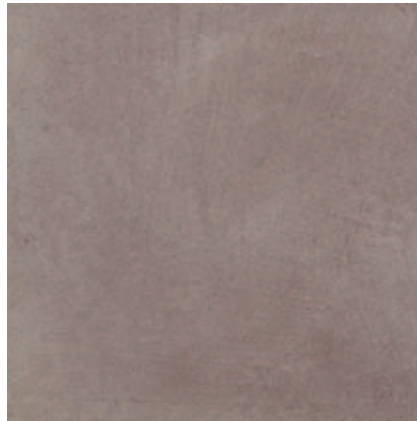
Eggplant | 519