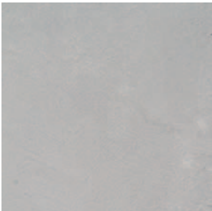
Shale | 516