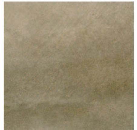
Olive | 520

Not shown but also available in Ivory | 517