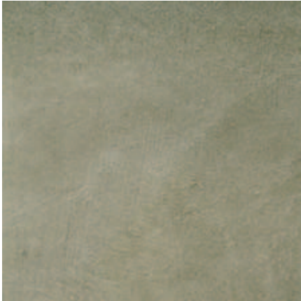
Moss | 510