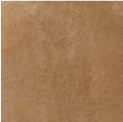
Adobe | 515