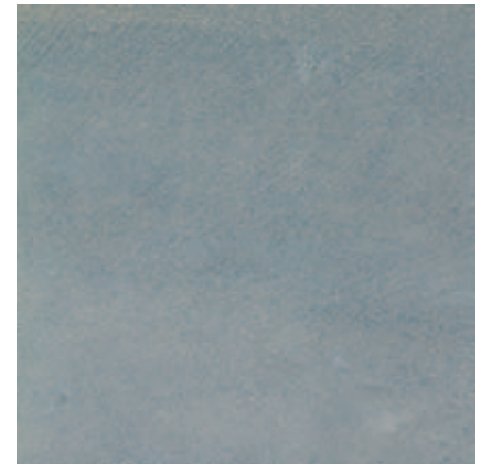
Denim | 504