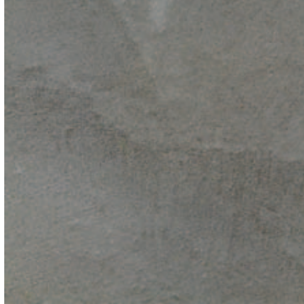
Onyx | 509