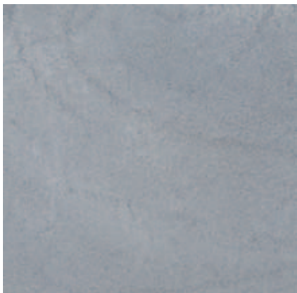
Armor | 514