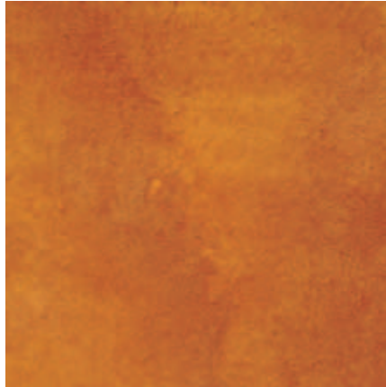
Copper | 508