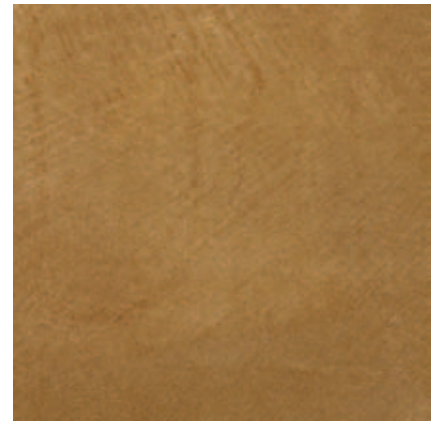
Camel | 505