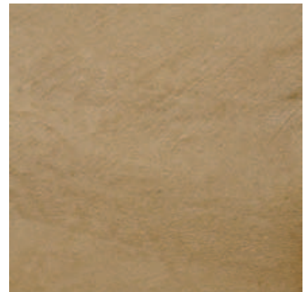
Mesa | 502