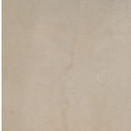
Sahara | 518